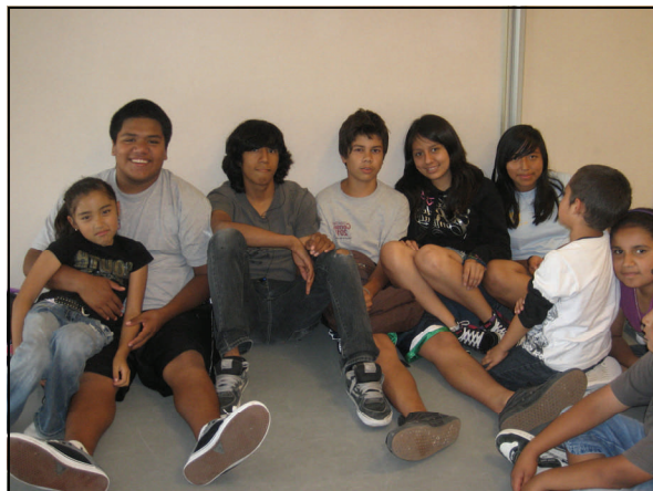
Counselors relaxing during the last day of camp