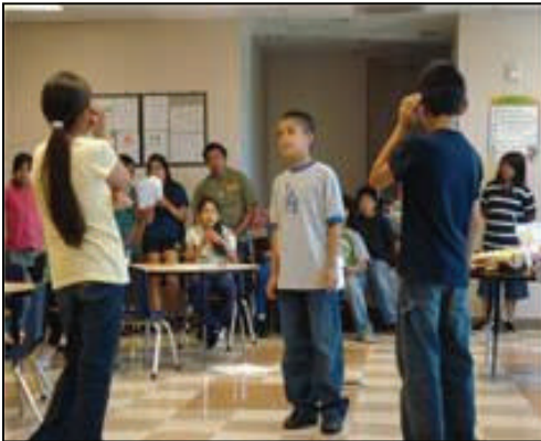
Chickasaw Cool Kidz acting The Mice Family .

This year the Chickasaw Cool Kidz performed plays based on different stories. The plays they performed were Pinocchio, The Mice Family, and Cinderella. Each camper got a role in the play and did very well performing. Some of the kids were really loud and really got into their characters. They practiced for days before their performance in front of the Seppy Patch Kids. Pinocchio was about a wooden doll that was turned into a real boy; an important theme was