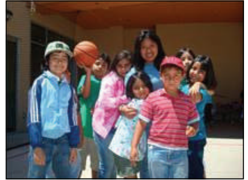
Los Beasties enjoying Sports.