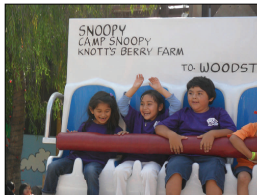
Los Chiquilines having fun at Camp Snoopy.

This year Seppy's camp took the campers to many thrilling and exciting field trips like; one of them was Hurricane Harbor. At Hurricane Harbor, the campers got super soaked and went on many amazing water rides. They floated on the lazy river, and rode the waves and the most famous ride in Hurricane Harbor, "The Tornado". They also went on the craziest