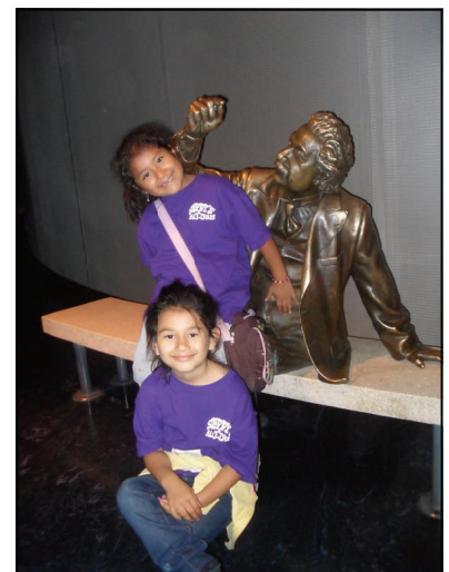
Los Chiquilines at the Observatory.

lated to space. We were able to watch a presentation on the importance of water and planet Earth; it was informative and interesting. We were also able to measure our weight due to the different gravity in different planets. After viewing the Griffith Observatory, the campers were able to play outside before we headed back home. Both were in different areas, but much fun! ■